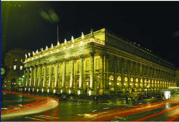
Grand théâtre