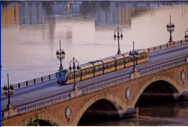
Pont de Pierre (F.Poincet)