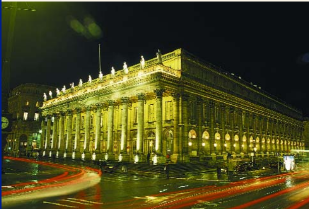
Grand théâtre (T.Sanson)

Photos courtesy of: Office du Tourisme de Bordeaux